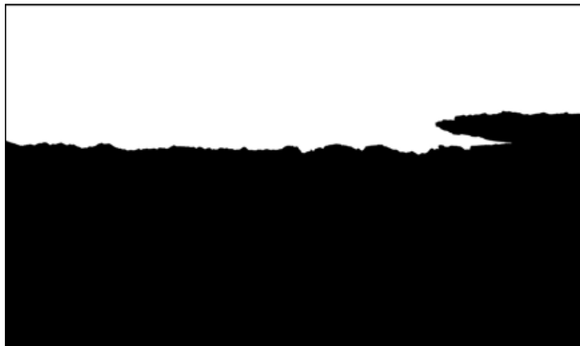
Replacing the sky using the channel masking technique from the CS4 book

created the drama that was required and the signature balls caught fire and became flaming planets. The balls were