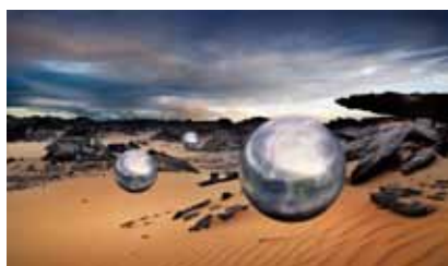
The chrome ball and planet earth are merged and then introduced into the host landscape

the state I live in has been in drought for nearly a decade.