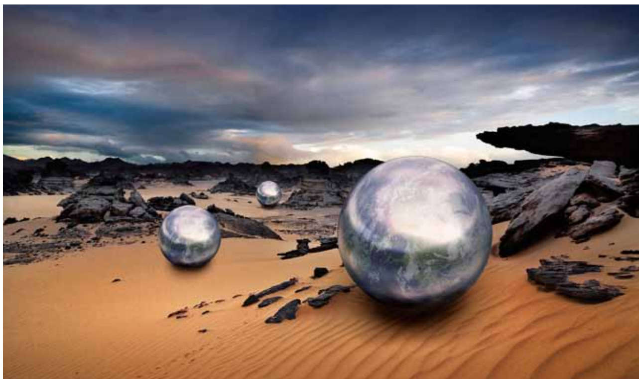
The finished result

The finished result as it appears on the cover of the new book. The new edition contains 32 additional pages, a brand new DVD interface, over 10 hours of movies (2 more than CS3), and 40% new content including new Raw workflows (smart workflows for even smarter photographers).