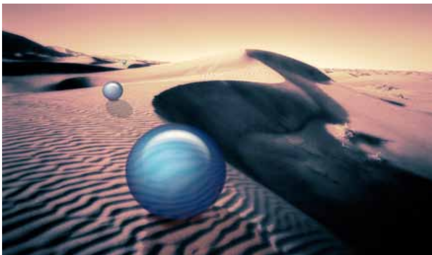
The original cover design image for Photoshop CS: Essential Skills

Coming from a commercial background I am not hung up on creating something with a completely original concept. I am, instead, more than happy to process and build upon the imagery that I have been