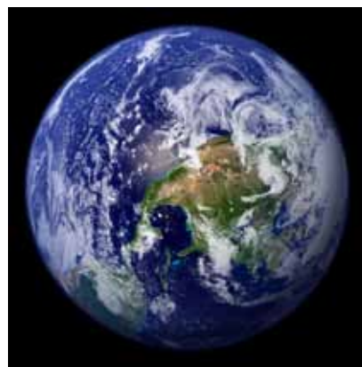
Planet earth (globe_west_2048.jpg) was downloaded for free from a NASA website providing royalty-free high-res images of our beautiful earth.