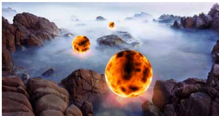
The cover for image Photoshop CS3: Essential Skills by Mark Galer and Philip Andrews

For the CS2 cover image I first experimented with just changing the balls and toning the sand dunes with different colours but the publisher wanted to see